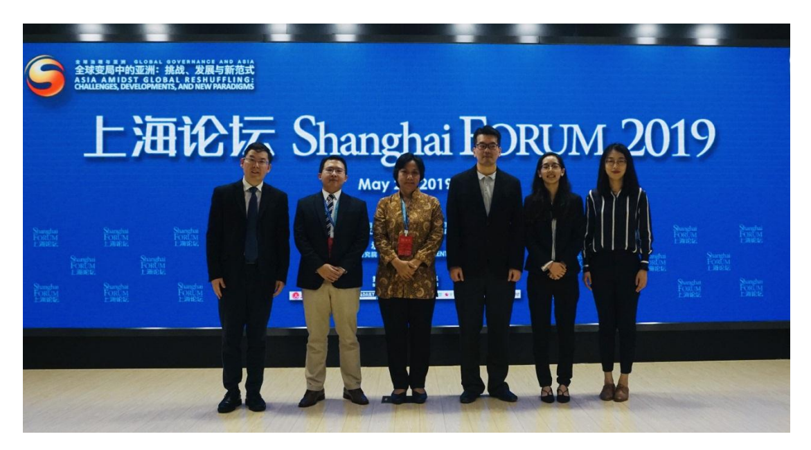
Group photo of cooperative research report release at Shanghai Forum 2019 closing ceremony (27 May 2019)