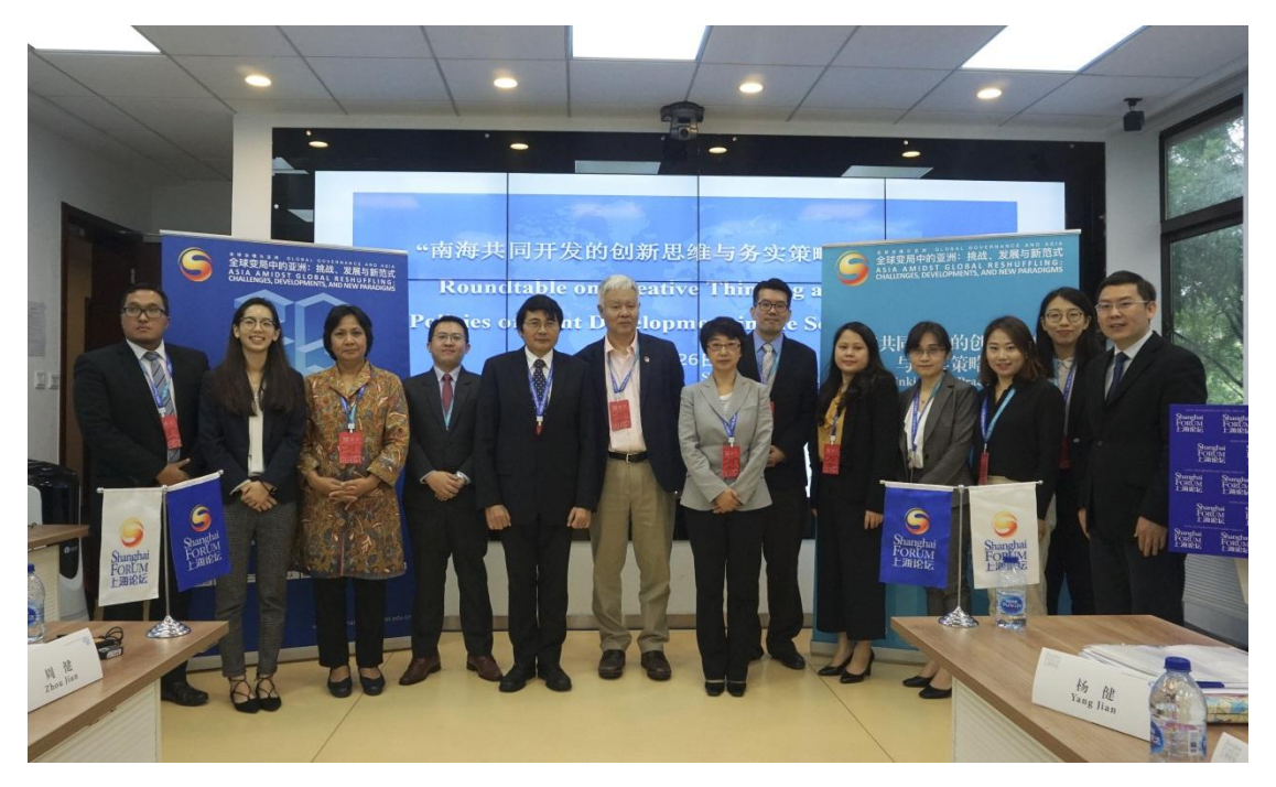
Group photo of the roundtable "Creative Thinking and Practical Policies of Joint Development in the South China Sea" (26 May 2019)