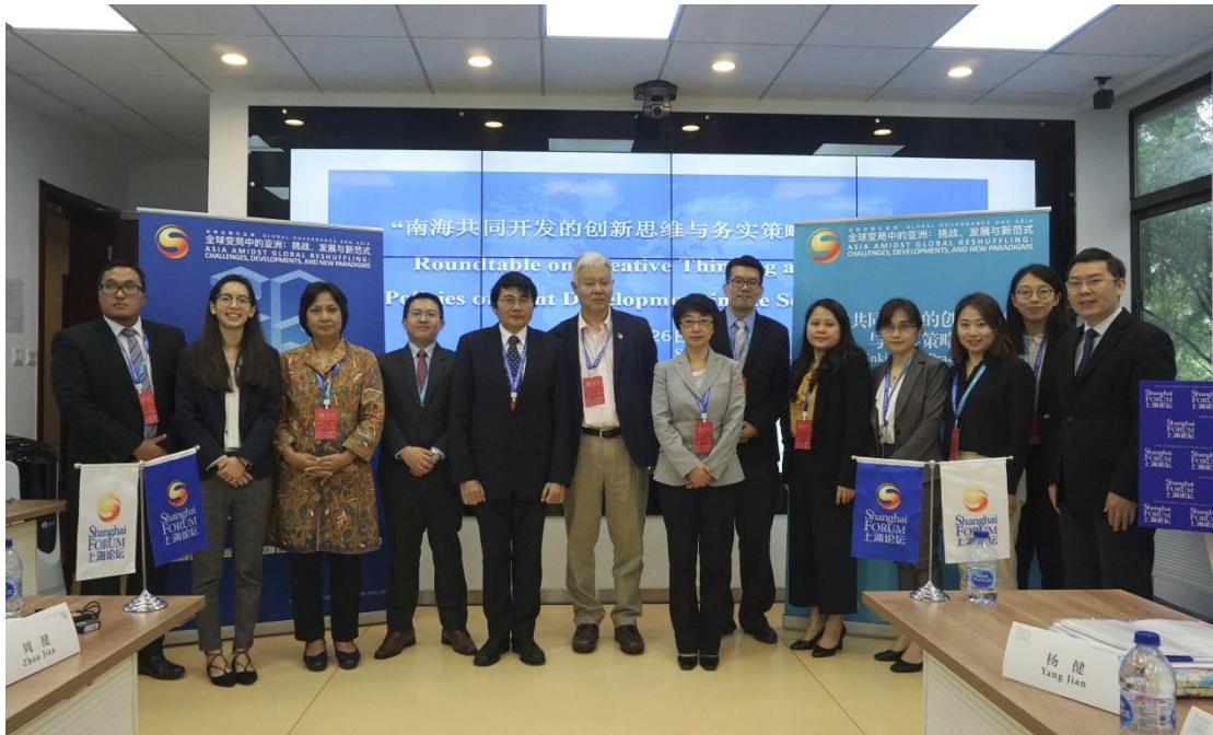
Group photo of the roundtable “Creative Thinking and Practical Policies of Joint Development in the South China Sea” (26 May 2019)