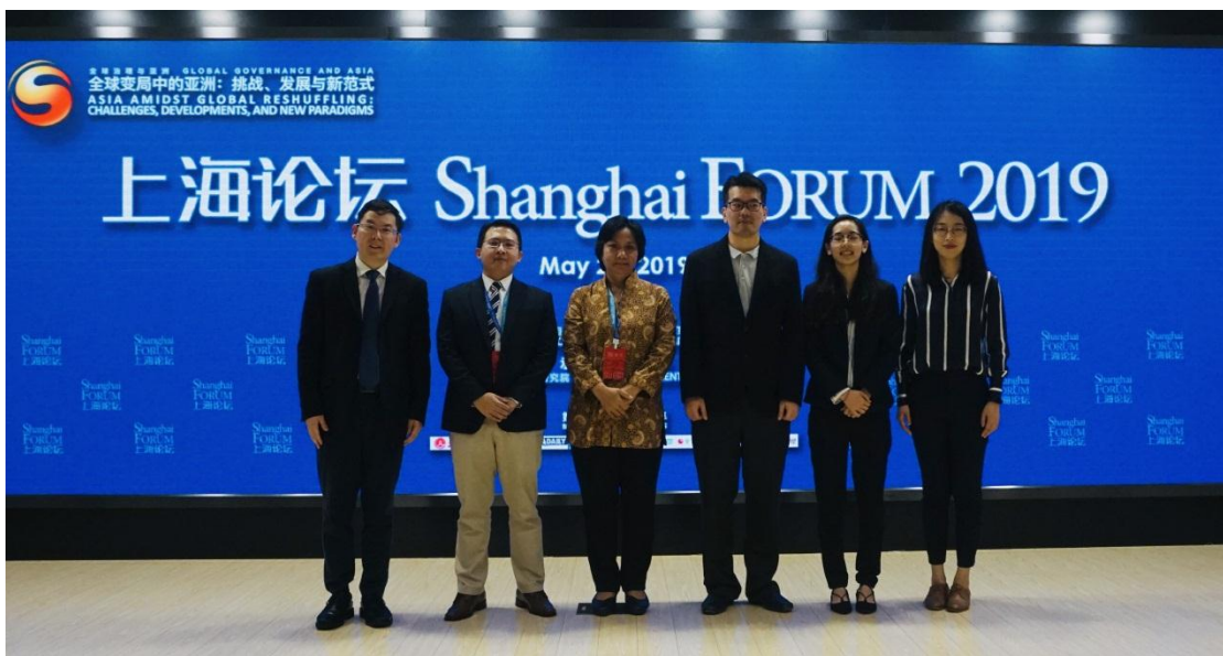
Group photo of cooperative research report release at Shanghai Forum 2019 closing ceremony (27 May 2019)